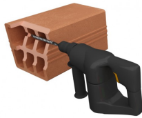
1. Gat boren.