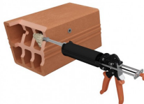
4. Vullen vanaf bodemgat naar buiten door bij het pompen telkens één maatstreek op de spuitmond achteruit te gaan.